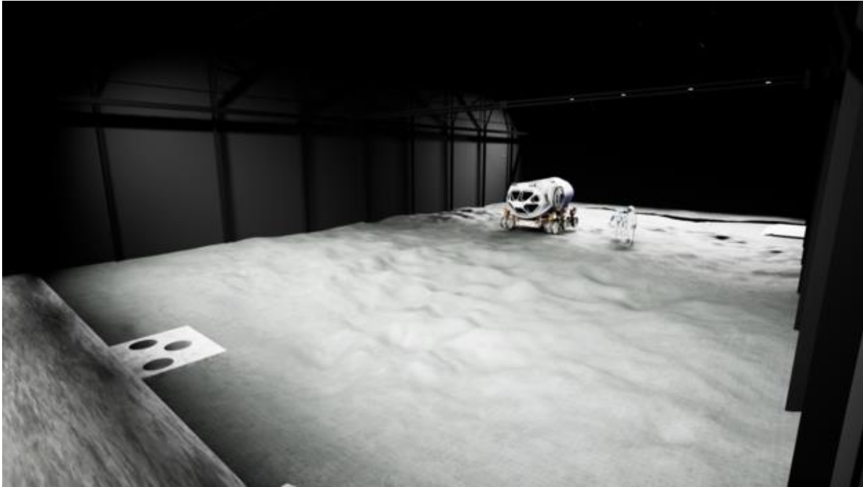
Figure 4: Virtual reality rendering of the LUNA Regolith Testbed (ESA “LUNA Facility brings Moon to Earth”, 17 Oct 2018)

There is still a lot to be done, however the concentrated, international approach seems to be on a very good way and the currently established target dates within the next twenty years 2020-2040 seem to be achievable.