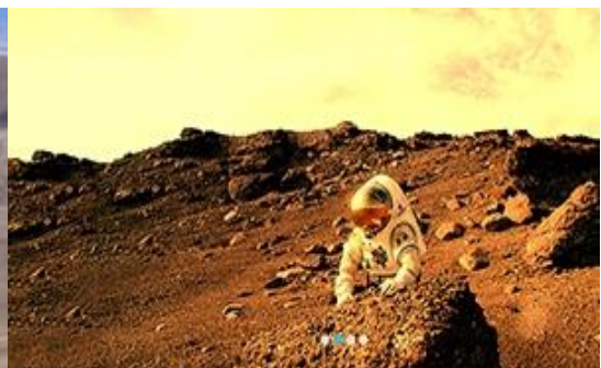
Figure 1: Astronaut at work at HMP