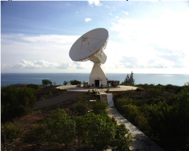
Figure 2. ESA 15m antenna in Maspalomas (set for EURECA)