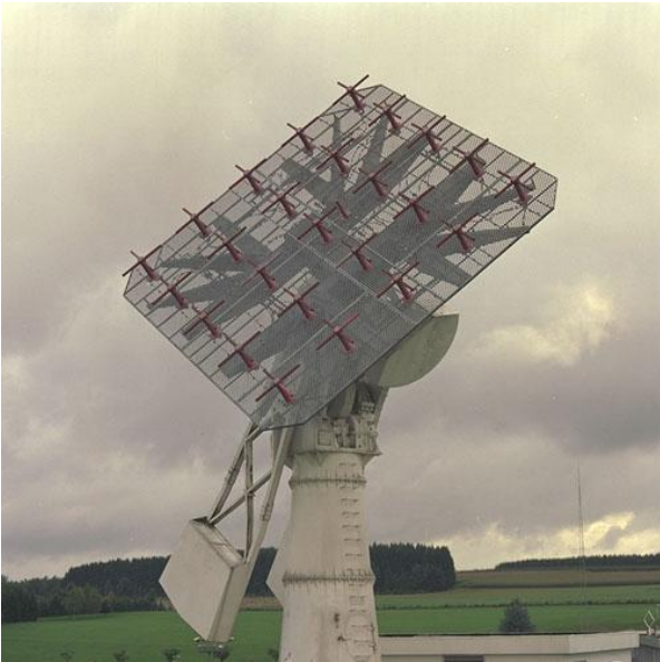
Figure 1. ESA VHF antenna in Redu

NASA ground station technology was widely used in the ESRO stations at the beginning; however, quite substantial technology development was initiated in parallel in Europe. One of the major developments of those days was the Redu VHF receiving antenna produced by an Italian company (Vitroselenia) and based on a planar design with distributed dipoles providing ca. 22 dB gain.